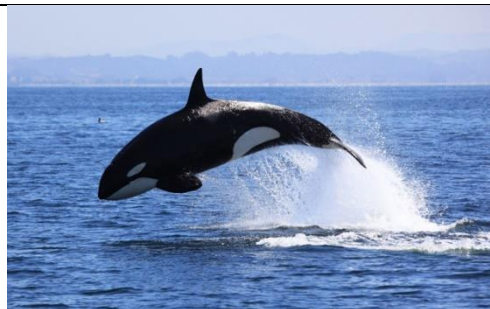
A killer whale