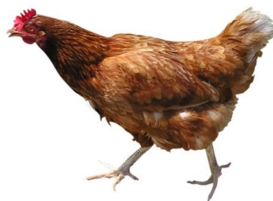
a hen (a chicken)